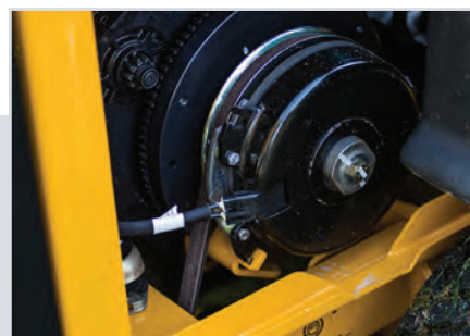
Hustler unika drivsystem